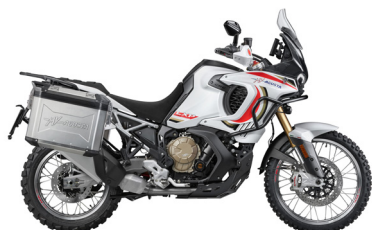
RC PEARL WHITE (GLOSS)/ MATT METALLIC CARBON BLACK)