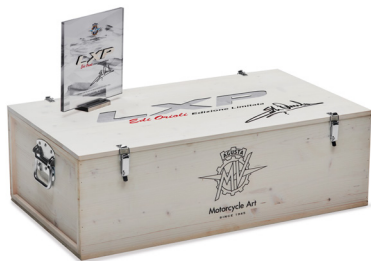
WOODEN DEDICATED KIT BOX WITH CERTIFICATE OF AUTHENTICITY