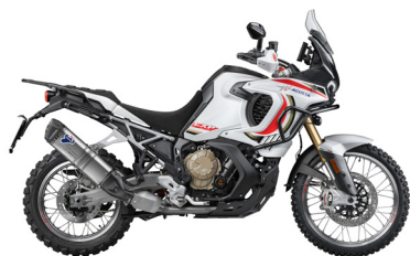
VERSION WITH DEDICATED KIT*