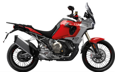
AGO RED (GLOSS)/ AGO SILVER (GLOSS)